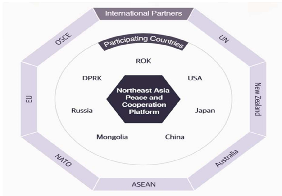
Figure 2: Northeast Asia Peace and Cooperation Platform